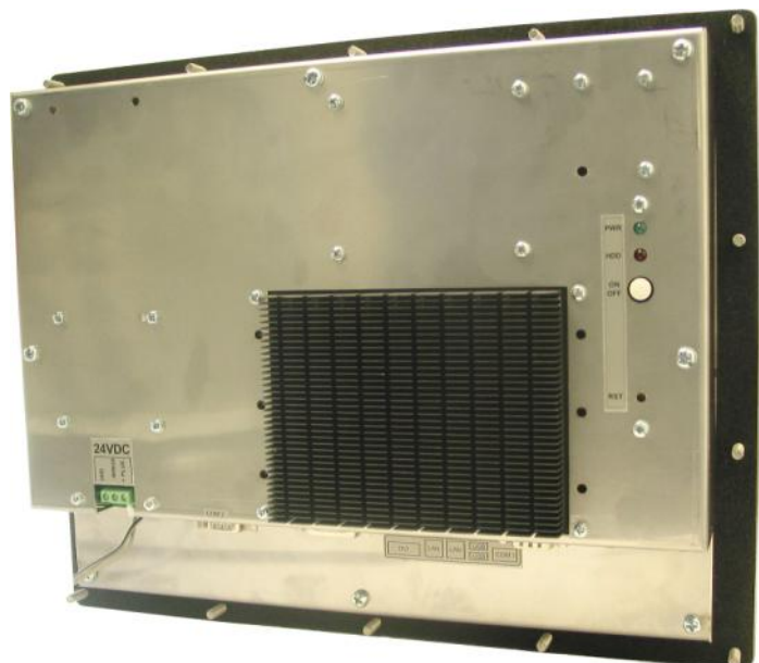
Back 12,1" Panel - PC