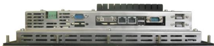
Bottom View 12,1" Panel - PC