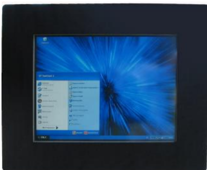
Panel-PC with 10,4" TFT Display and Standard Front Bezel

The PC is available with 6 different Display Sizes. Depending on the mounted Display, the