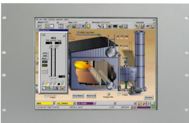
19" Rack Mount Front Bezel, RAL 9006