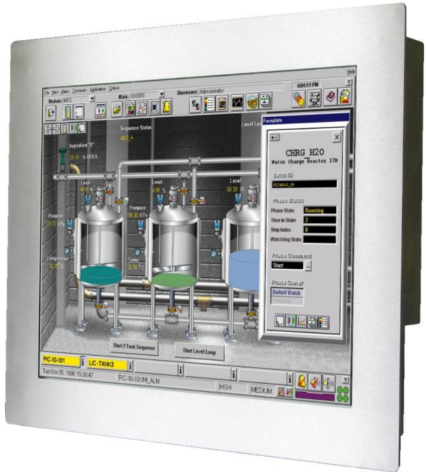
Panel-PC with 19" TFT Display and Stainless Steel Front Bezel

UTICOR offers with the IPPLP a series Panel PCs, which have a completely fanless Design.