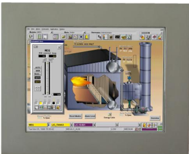
Stainless Steel Front Bezel