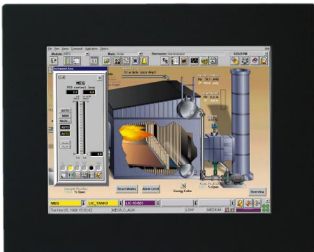
Black Front Bezel, RAL 9005