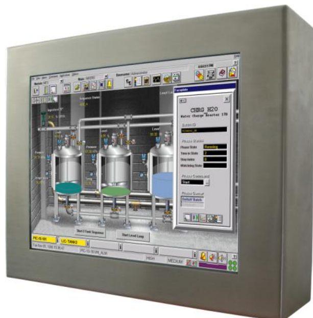
Workstation with IP 65 Housing